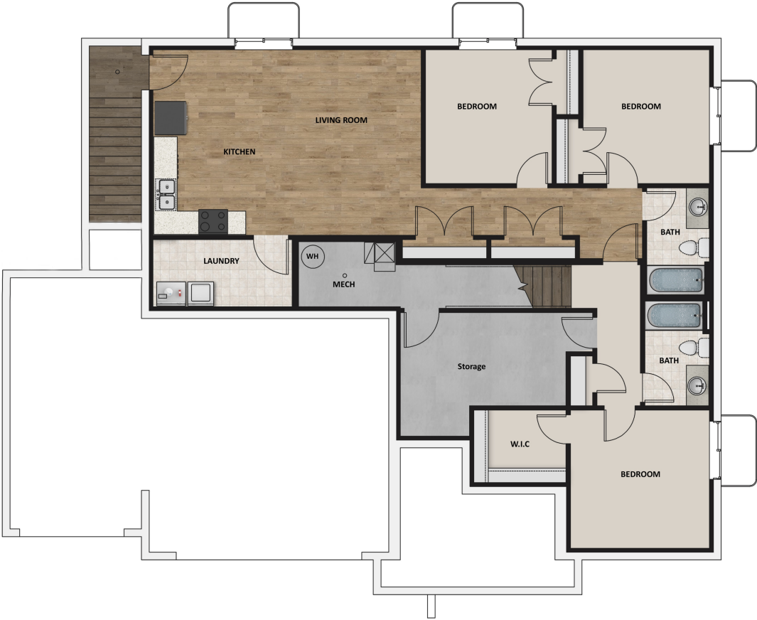
Finished Basement Floor